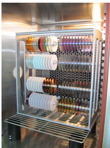
- DVDs on their support in the climate chamber CLIMATS –

The discs were stored in climate chamber programmable in temperature and humidity : CLIMATS Excal 5423-U.