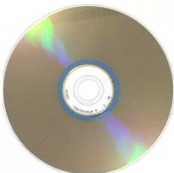
DVD+R MPO GOLD