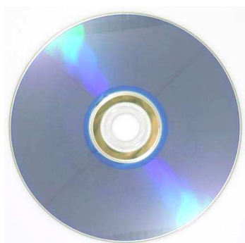
DVD-R VERBATIM Archival